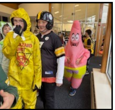
SCHOLASTIC BOOK FAIR

The Elementary Scholastic Book Fair was held November 10-14, 2025, and was a huge success! Thanks to the amazing support of our community and volunteers, we were able to pull off the most successful fair yet! The Book Fair helps raise much needed funds that will directly support library programs and student activities. The continued support from the community, everyone who shops, volunteers, or spreads the word about the fair continues to help build our library and inspires a love of reading throughout our school.