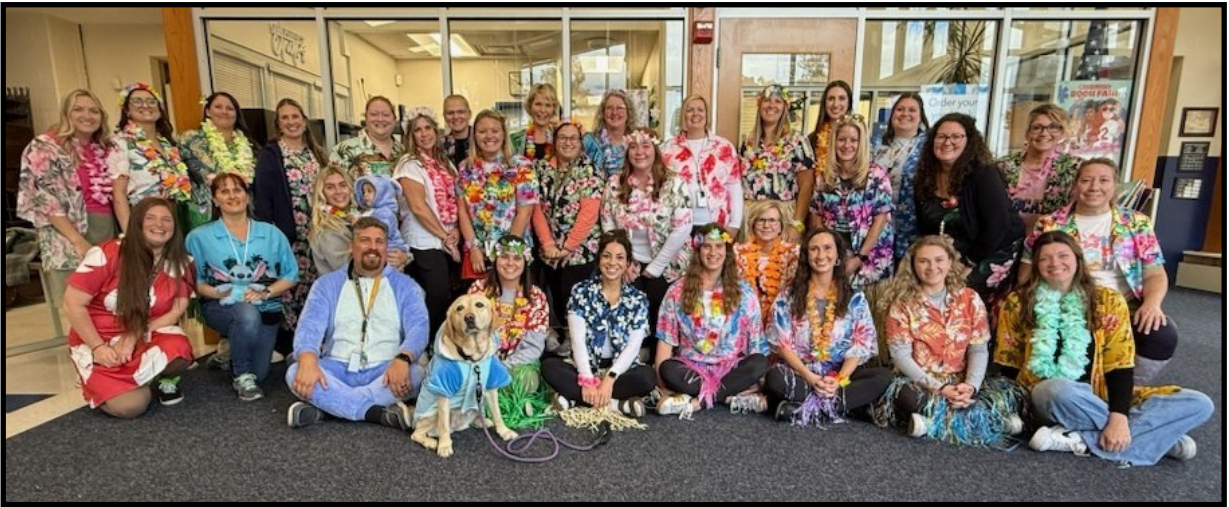
ANNUAL HALLOWEEN PARADE