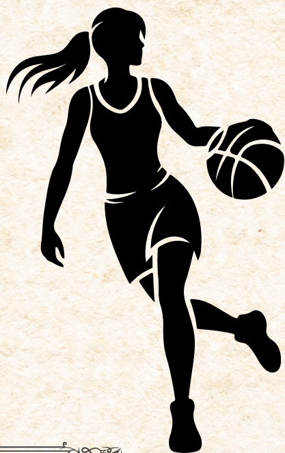
The Whiteford Girls' 8th grade basketball team was playing Erie Mason and they won.