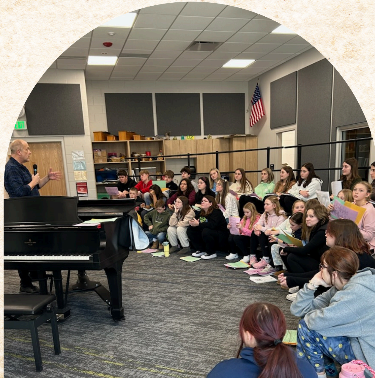
The musical cast is listening to Mr. Schreiber explain the schedule of the musical. Depending on the parts, practices are after school until 5.