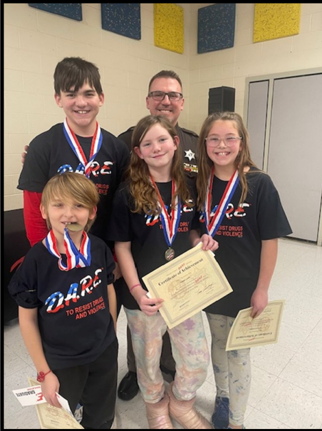
5th Grade D.A.R.E. Graduation

On January 10, 2025, the 5th grade students had their D.A.R.E. (drug abuse resistance education) graduation. The program aims to prevent drug abuse and unkind/harsh behaviors and it also focuses on helping students make good choices physically and socially. Sergeant Bomia was once again the incredible D.A.R.E. instructor.