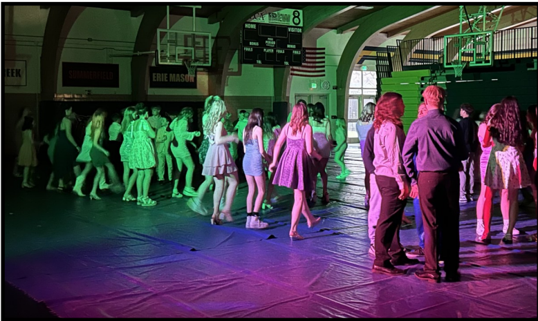
Middle School Spring Fling

Middle School Student Council decided to do two formal dances this year, as opposed to last year's one dance. They had their Fall Formal back in November, and their Spring Fling at the beginning of April. No theme was planned for this dance other than FUN! Students showed up dressed in their very best, and had a blast dancing with their friends and requesting their favorite songs.