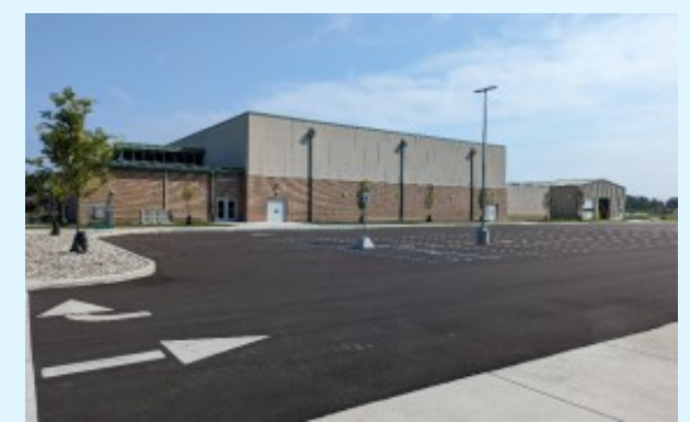
Multi-Purpose Gym Entry New Parking Lot