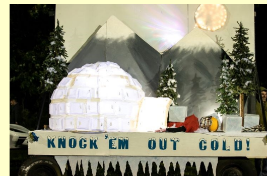
FRESHMAN FLOAT (WINNER)