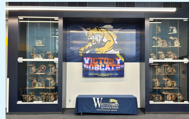
Multi-Purpose Gym Vestibule