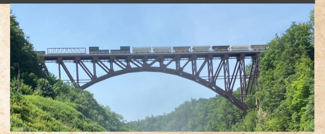
The Lievens family went up north