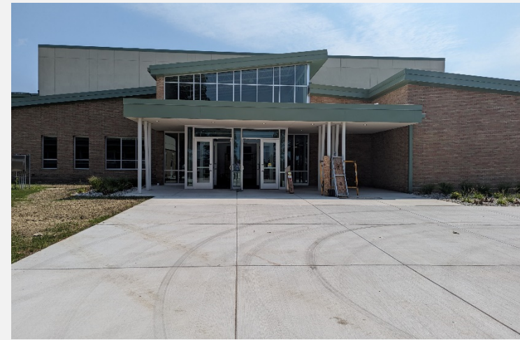
Multi-Purpose Gym Entry