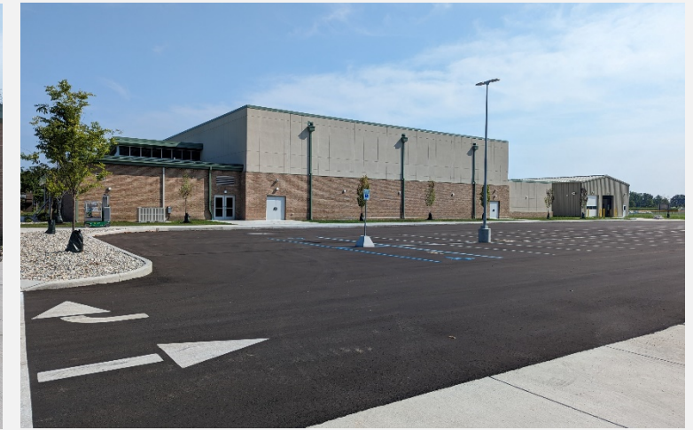
New Parking Lot